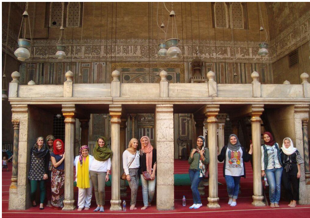
FELLOWS AT SULTAN HASSAN (EGYPT 2016) *A MASSIVE MOSQUE LOCATED IN THE OLD CITY OF CAIRO, IT WAS BUILT DURING THE MAMLUK ISLAMIC ERA IN EGYPT IN 1359