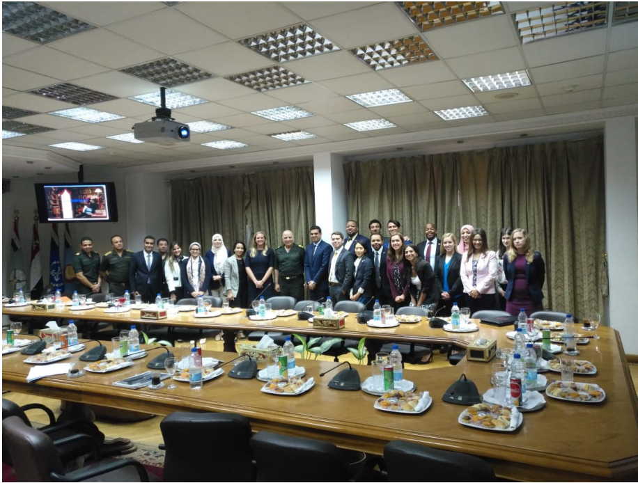
2018 GABR FELLOWS WITH MAJOR GENERAL MOHAMED ELKESHKY, DEPUTY MINISTER OF DEFENSE FOR FOREIGN AFFAIRS, MINISTRY OF DEFENSE

Our 2018 American and Egyptian Fellows had a successful trip to Egypt between August 31 st and September 8 th . During this visit, they had the opportunity to meet with the Minister of Tourism, the Deputy Minister of Defense for Foreign Affairs, the President of the American University in Cairo, and many more. Through this experience, insights were gained, deep knowledge was ascended, new friendships were cemented, tough questions were answered, and substantive discussions were facilitated. The second portion of the 2018 Fellowship is taking place in the United States between September 30 th and October 6 th in New York City, New Jersey, and Washington, DC. Through another intensive week, our Fellows will continue dialogue about a very wide spectrum of subjects.