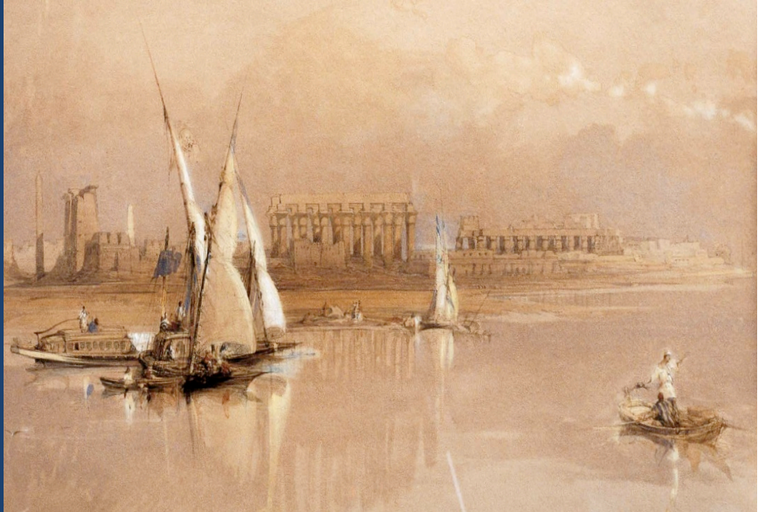
David Roberts A General View of the Ruins of Luxor from the Nile The Shafik Gabr Collection

For earlier itineraries of the US program, please see the previous years' reports at https://eastwestdialogue.org/fellowship/brochures/