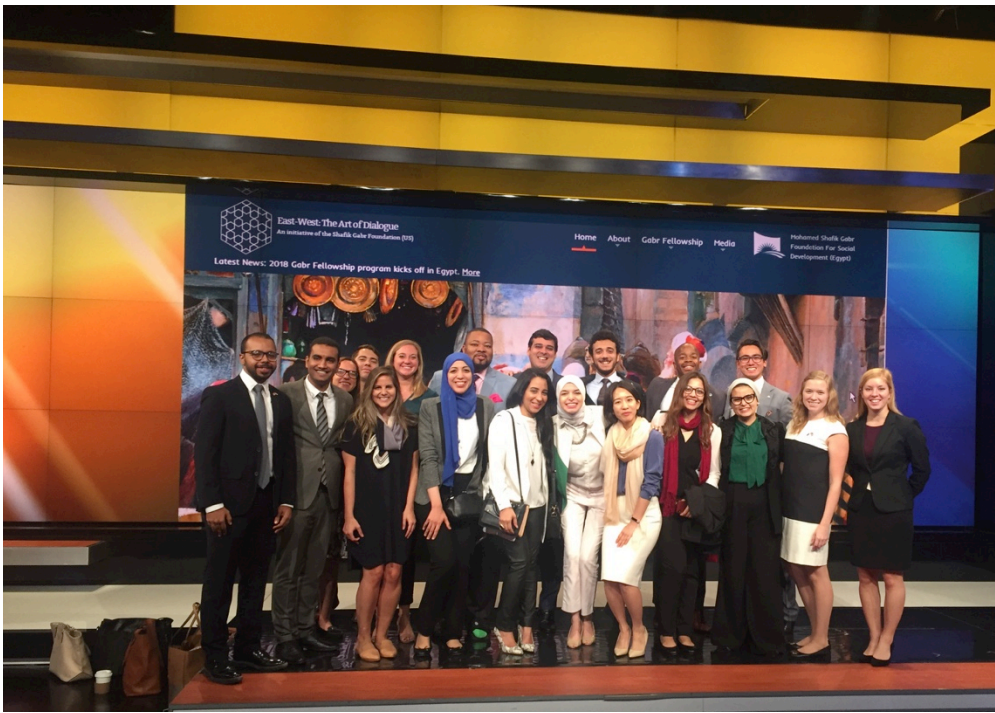
2018 GABR FELLOWS AT CNBC STUDIOS