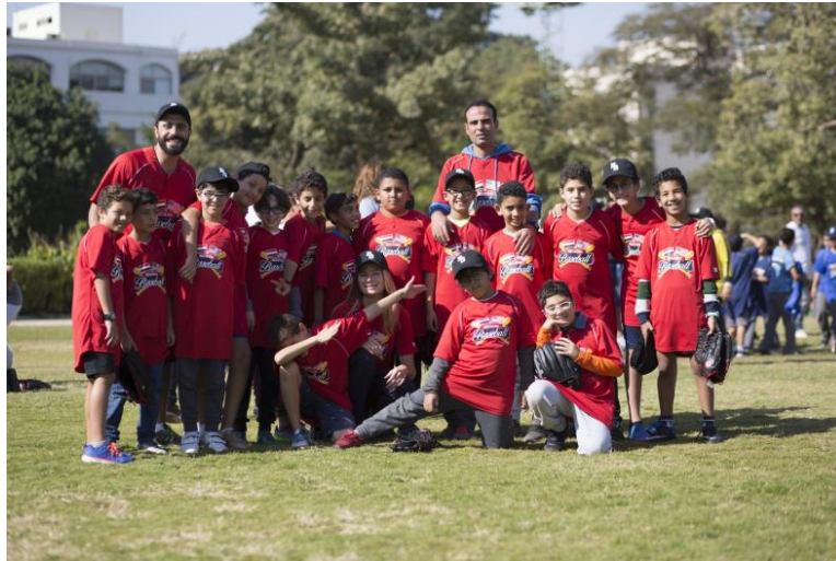
Because Baseball coaches with youth in Egypt (April 2019)