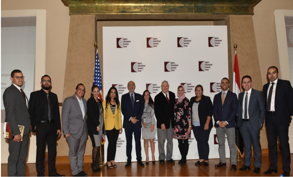
GABR FELLOWS WITH REP. DANA ROHRABACHER AT THE ROUNDTABLE DISCUSSION 'US-EGYPT BILATERAL RELATIONS' HELD AT ARTOC HQ IN CAIRO ON DECEMBER 10, 2019