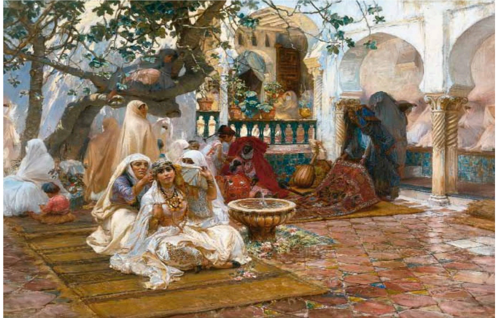
Preparations for the Wedding, Algiers, Frederick Arthur Bridgman

For earlier itineraries of the US program, please see the previous years' reports at https://eastwestdialogue.org/fellowship/brochures/